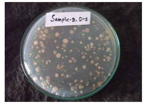
Figure 1. Colonies of actinomycetes appeared on the dilution plates using the marine soil sample.

Among the 29 isolates, 73.53% exhibited antimicrobial activity during primary screening (Table 2). The isolate AIAH-10 showing promising broad spectrum activity against different pathogenic organisms (Figure 2) was selected for further study. The potential strain AIAH-10 was identified by morphological, cultural and biochemical study. The complete data was reported in table 3 and 4. Findings of this study suggested that the strain was belonged to Streptomyces sp.