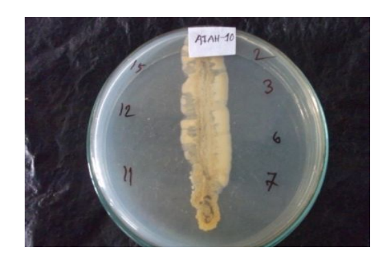
Figure 2. Antibacterial activities of the isolates (against Streptococcus agalactiae (2), Bacillus cereus (3), Pseudomonas aeruginosa (6), Escherichia coli (7), Shigella dysenteriae (11), Shigella sonnei (12) and Agrobacterium (15)) through single line streaking technique.

The ethyl acetate extracts did not show any hemolytic activity when tested against human erythrocytes. The results of the brine shrimp lethality bioassay are shown in Table 6.Test sample showed different mortality rate at different concentration. The mortality rate of brine shrimp nauplii was found to be increased with the increasing of concentration of the sample. The larval mortality was recorded as 100% in 40 \mu g/ml and higher concentrations. The median lethal concentration (LC<sub>50</sub>) of the extract was found to be 6.61 \mu g/ml (Figure 3).