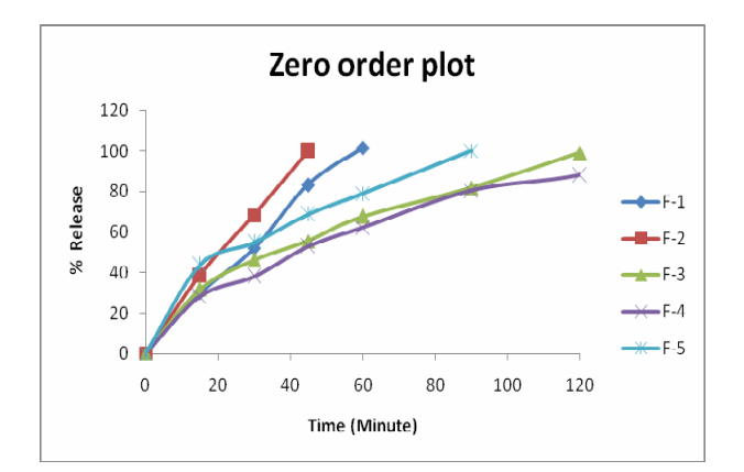
Figure 2. Zero order release profile.

From the Table 3, we see that, F-2 & F-5 followed first zero order release kinetics having the polymeric combination namely HPMC K4M/ CP 934 P & HPMC K4M/ CP 934 P/SCMS successively. Whereas, F-1 & F-4 have followed higuchi release having polymeric combination of HPMC K4M/SCMC & HPMC K4M/CP 934 P/ PVP K30 respectively. Only F-3 have followed both zero order and hixon-crowell